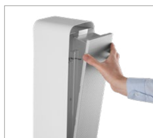
Opening the light source's cover enables direct surface disinfection.