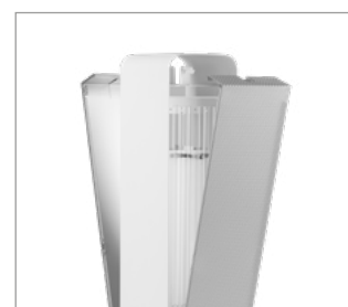
One or two-way direct surface disinfection possible.