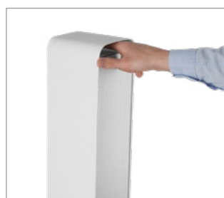
Convenient opening handle and slot for luminaire manoeuvring.

After opening the light source's cover, the lamp should be directed at the surface for a specified time to effectively disinfect it. However, it should be remembered that UV-C light is harmful to the skin and eyes. When using the lamp in this form, no one should be in the range of the light beam. Careful reading of the user manual is required before use.